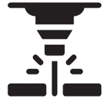
Easy to Process