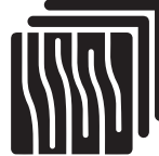
Alternative to Wood