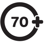
70+ Shore D Hardness