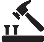
Can be nailed