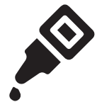
Can be Glued