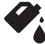
No demolding oil required